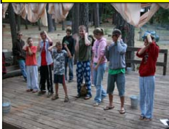
Learning new songs