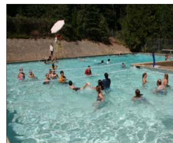
Competing in Olympic Games