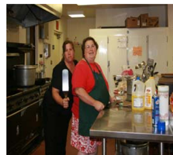
The Cook's great food