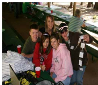
Fun camp counselors