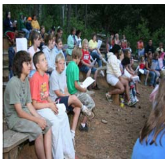
Singing at Campfire