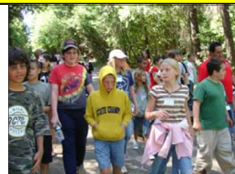
Hiking to Bullards Bar Dam