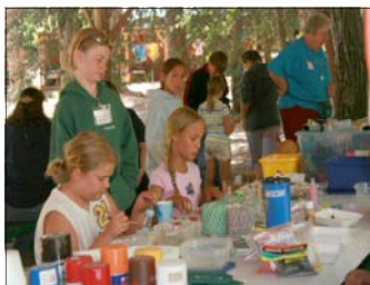
Creating works of art