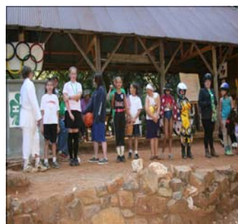
Dressing up for the costume contest