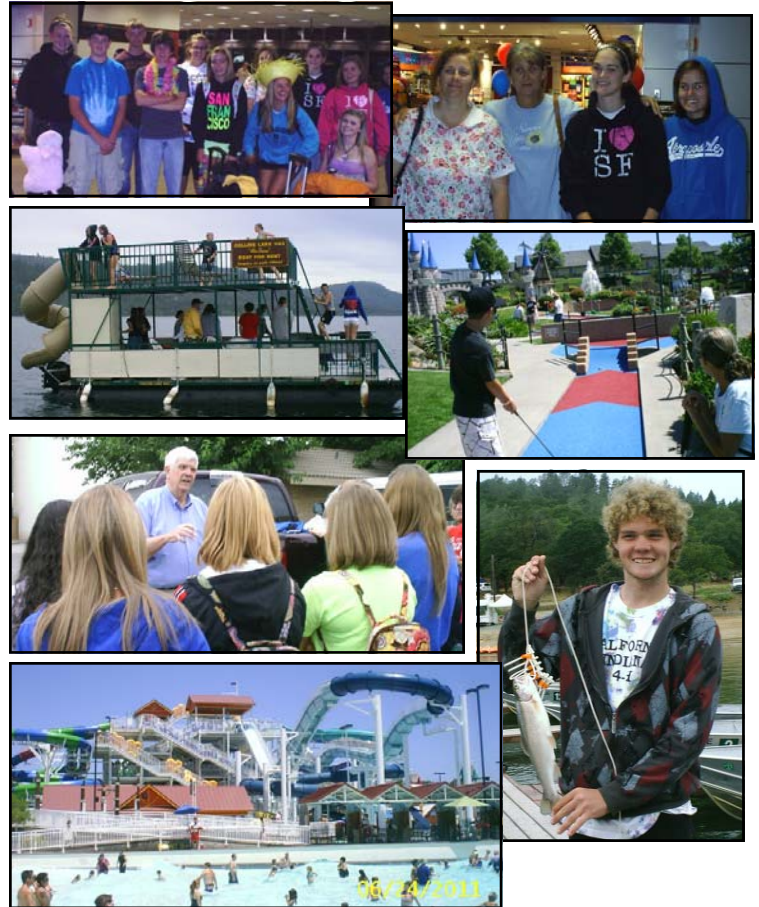
Above - Hi 4-H having fun with Indiana exchange group

Submit club reports by August 19th for the September Clover Chatter to rjmccrory@ucdavis.edu .