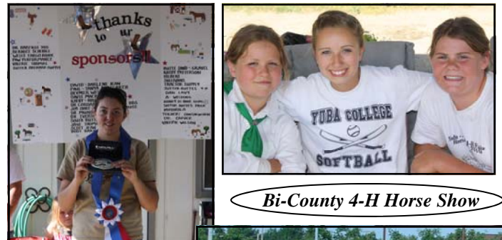
Bi-County 4-H Horse Show