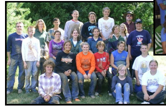
Tour of Kohler Design Factory