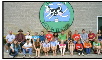
Holsum Elm Dairy