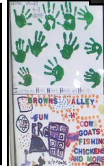
Window Displays - Denter, Browns Valley, Sutter Buttes & Pleasant Grove