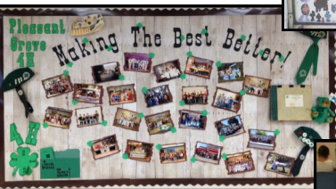
below - Craft Day October 20, 2012