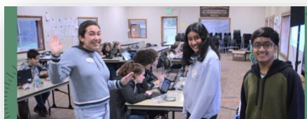
4-H Virtual Code Camp July 27-31

The Santa Clara County 4-H Computer Science Pathway Team is planning a Virtual Summer Code Camp, and needs your help! We are seeking energetic adult and youth volunteers who would like to head one or more of the following: