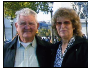
50th Wedding Anniversary October 26, 2007