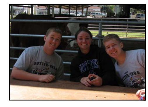
Learn by doing... ... It's Just National!