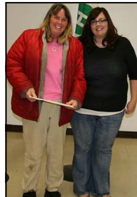
Above: Pleasant Grove and District 10 4-H Club honorees from Leaders' Appreciation Night