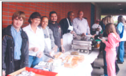
The Plumas Club Fundraiser BBQ Raised over $500.00 to Pay for This Year's Revue!