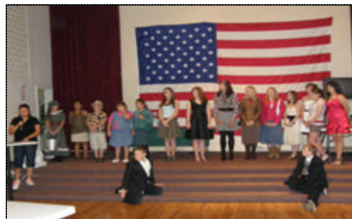
22 Modeled at Emblem Club Luncheon: The Club Raised Almost $300.00 for Future Fashion Revues