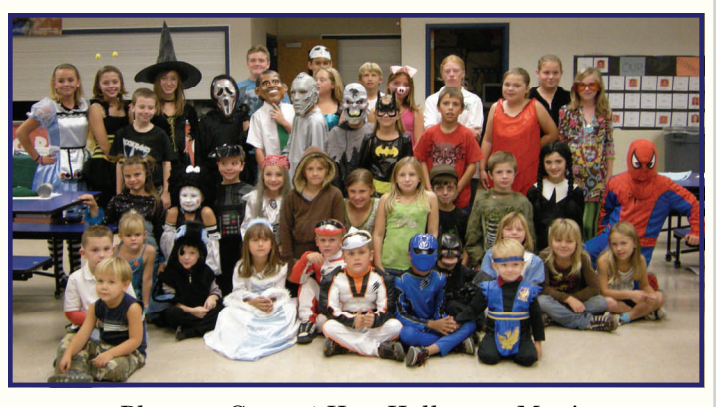
Pleasant Grove 4-H — Halloween Meeting