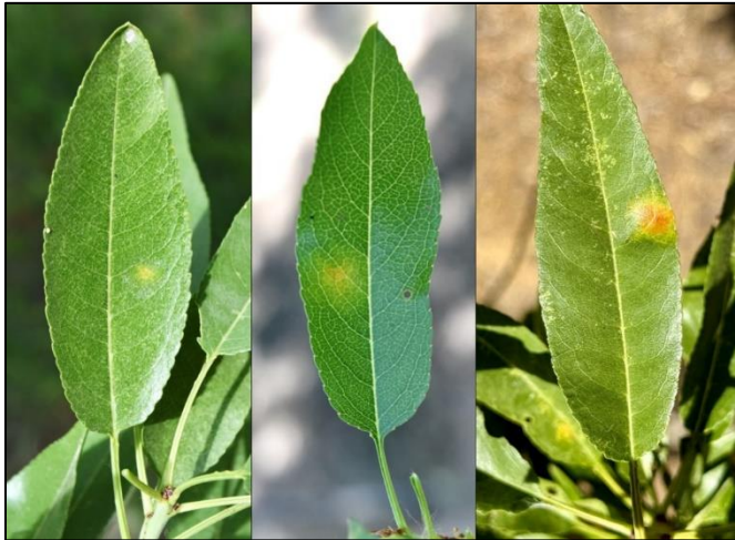
Figure 1. Early symptoms of red leaf blotch include small, pale yellowish spots or blotches that affect both sides of the leaves. (Picture credits: Alejandro Hernandez and Florent Trouillas).

If you suspect that you have this new disease in your almond orchard, please contact your local UC Cooperative Extension farm advisor