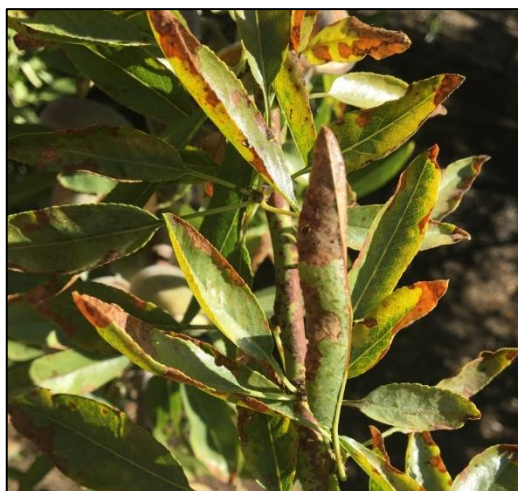
Photo 1. Leaf burn symptoms associated with very low potassium. Potassium leaf concentration in Sonoras was half of the K value in Nonpareil in the same orchard.

I had a number of farm calls this summer for leaf burn in almonds. It was often much worse in Monterey than the other varieties, and in fields with strong disease management programs. The culprit? Low potassium. It's an understandable problem to arise when input prices are high and almond prices are low. Gone are the days of throwing on a little extra just in case. Everyone is trying to find that sweet spot of delivering just enough inputs to maintain healthy trees and a good crop, and it's easy to miss that mark when margins are so thin.