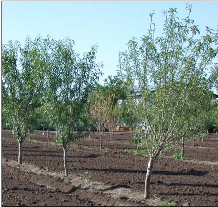
Figure 1. A pale, weakened tree in the front right, dead trees in the background. Nothing here for gophers to eat but your trees!