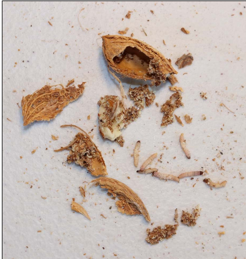
Nonpareil infested with multiple NOW collected from a non-sanitized, late-harvested orchard.

Sanitation directly reduces overwintering populations AND limits development sites for next year's early generations!