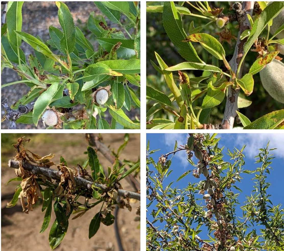
Independence on Hansen (top), Independence on Viking (bottom left), Nonpareil on Krymsk (bottom right). Spotted and misshapen leaves, dead leaf bundles, dead flowers, and aborted nuts were all common symptoms of bacterial blast this year.

With our chilly winter, many growers, managers, and PCAs were finding outbreaks of bacterial blast in their almonds this spring. Blast, which is caused by the bacterium Pseudomonas syringae , is normally seen affecting flowers and leafy spurs exposed to cold, wet weather. Blast is a challenging disease to control, given the limited number of available tools. This year, symptoms were common even in orchards which had received one or more copper dormant sprays (copper-resistant Pseudomonas populations are common throughout the state). Kasumin is also available and effective for blast control, but is expensive and can be cost prohibitive, especially if prolonged wet weather necessitates repeated applications. This leaves temperature/frost control in an orchard as your least expensive and most effective blast prevention strategy.