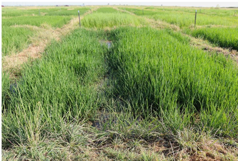
Fig. 2. Rice phytotoxicity damage at 50 days after planting in plots treated with Zembu, Bolero, and propanil. Rice recovered by 90 days after planting.