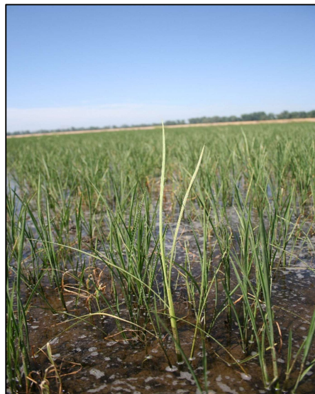
A rice plant affected by bakanae.

We have been getting calls about tall, light-colored plants in rice fields. These plants have the characteristic ligule of rice plants. The symptoms are consistent with rice infected with bakanae , a seed-borne disease.