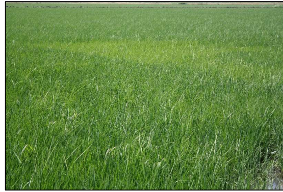
A rice field infested with bakanae.