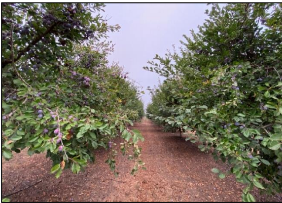
Photo 1. At the Butte rootstock trial site (no bacterial canker pressure) plum rooted trees were among the largest, highest yielding, and provided some of the lowest dry-aways.

Growers have chosen Krymsk primarily because of its legendary anchorage, however the rootstock has several flaws growers should be aware of before purchasing. Finally, although not widely planted, Viking proved to be an excellent rootstock in recent UC trials and should be considered. No rootstock is flawless. Growers should understand all the qualities of a rootstock ahead of the planting decision.