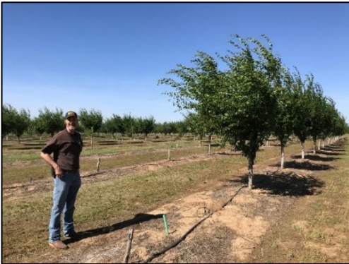
Photo 2. Viking in the foreground had perfect survival at the Yuba County rootstock trial site with high bacterial canker pressure.

Plum x Peach: As previously noted, Krymsk is now the number one choice of rootstock for prune production largely due to its stellar anchorage and success in Sacramento Valley almond production. For an industry long plagued by orchards with poor anchorage and in certain spots – bacterial canker – this rootstock had perfect survival at the bacterial canker site. At this site it also had the highest yields after 10 years of the 14 rootstocks. The rootstock is susceptible to plant parasitic nematodes, salinity, and prune brownline. There are a growing number of almond varieties with compatibility issues with Krymsk and it remains to be seen if there will be any compatibility problems with the new prune varieties being developed at UC Davis. Despite having some important flaws – it remains to be seen if the rootstock’s current strength in prune sales will lose any ground in the coming years.