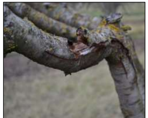
Figure 2. Broken limb in young orchard caused by P. tuberculosus .

released from the undersides of fruiting bodies, with pruning wounds serving as the initial sites of infection. It is unknown exactly how long a pruning wound remains susceptible to Phellinus infection, but if inoculum is present and there is sufficient moisture, it may be years. Reductions in size and number of pruning wounds and pruning during dry