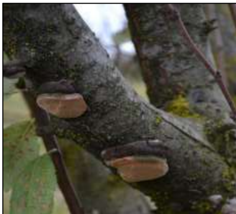
Figure 1. Fruiting bodies of P. tuberculosus

Prune orchard surveys throughout the Sacramento Valley in 2016 and 2017 found significant presence of the wood decay fungus Phellinus tuberculosus . Phellinus causes decay in the heartwood of trees and often goes undetected until fruiting bodies appear (Figure 1) or branches break exposing the decay within (Figure 2). Broken limbs caused by Phellinus were found in orchards as young as 7 years, while every orchard older than 12 years had a high incidence of broken limbs and Phellinus infection. Phellinus is spread via spores