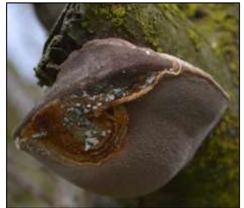
Figure 3. Trichoderma sp. parasitizing P. tuberculosus fruiting body.

On several instances during our survey work, Trichoderma spp. were isolated from Phellinus decay. Trichoderma spp. are often found colonizing Phellinus fruiting bodies (Figure 3). Trichoderma spp. are free-living fungi, antagonistic to other fungi, and are also mycoparasites, meaning they can compete with and consume other fungi. Trichoderma spp. have been shown to be effective bio-control agents and many commercial products are available for the control of soil-borne fungal pathogens. We are testing six commercially available bio-control products in the laboratory for their efficacy at preventing Phellinus decay and killing the pathogen. Our preliminary results indicate that pruning wound protection with Trichoderma -containing products might be effective at preventing Phellinus infection. However, field testing is needed before specific treatment guidelines can be developed. In February 2019, we will begin field trials to evaluate Trichoderma products as pruning wound protectants and determine their ability to infect and kill Phellinus fruiting bodies.