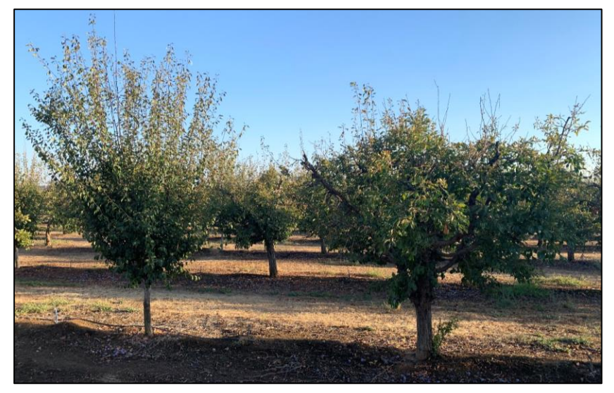
Contrasts of tree age and health. Young healthy tree on the left and canker damaged tree on the right. To reduce chances of the left tree looking like the tree on the right in the future, protect pruning wounds with fungicide as soon as possible after cutting and before rain.

* Talk with your PCA about pesticide rates, REIs, and timings. Always read the label. Any mention of a chemical is not a pesticide recommendation, merely the sharing of research results.