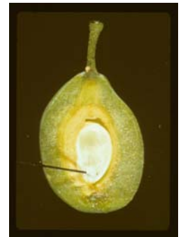
Figure 1. Extracting endosperm at reference date.

Removing some of the fruit early in the season will allow the remaining fruit to grow larger and develop a higher sugar content and improved drying ratio. Mechanical thinning with the same machinery used for harvest is the most practical way of accomplishing this. A representative sample taken at reference date, when the endosperm is visible at the flower end of the fruit (Fig. 1), usually in early May, will allow for an estimation of fruit size at harvest (Table 1). Unfortunately, this procedure will often over-estimate size, especially with a heavy crop load. To get a better idea, using your experience and past production history, estimate the tonnage you can produce at the desired size and determine how many fruit per tree at harvest will result in this yield. For example, 4 tons (8000 lbs) X 70 dry fruit per pound divided by 151 trees per acre (in a 18' x 16' planting) = 3708 fruit/tree at harvest. Adjust this by the estimated pre-harvest drop to determine how many fruit should be left after thinning. Work done in the Sutter-Yuba area in the 70's suggested that approximately 40% of the fruit would drop between reference date and harvest. More recent work in Glenn and Tehama Counties has suggested that fruit drop may be