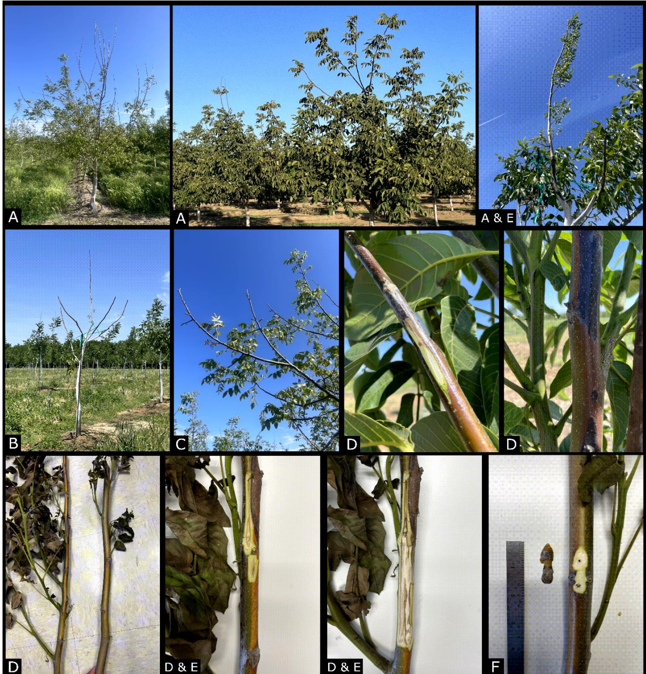
A. Weak or dead terminal budwood and smaller upper limbs B. Major limb death, mainly in the upper and exposed portions of the tree, and/or apparent whole tree death C. Delayed leaf-out in affected limbs D. Darkened or orange-tinted wood, with gray/black streaking in the cambium underneath E. Sunburn on damaged limbs, usually on south- and west-facing sides F. Dead buds

This past spring (2024), growers in Sutter, Yuba, Yolo, and Tehama counties reported symptoms of freeze damage, likely from an early autumn freeze that occurred near Halloween. If you noticed any of these symptoms in your orchards this past spring or are aware of cold pockets in certain areas/fields, consider the following steps to prevent another year of freeze damage.