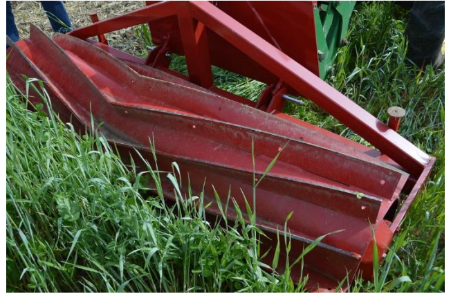
Figure 1. Roller crimper implement.

Roller crimping is a common practice in other parts of the country but had not yet been studied in California orchard systems. A roller crimper is a drum-shaped implement with blunt curved blades (Figure 1.) that rolls over and crushes down the vegetation without disturbing the roots. This creates a mat of biomass over the soil's surface, similar to mulch. This has been shown to reduce soil temperatures, conserve soil moisture, decrease erosion, and reduce herbicide use. The timing of roller crimping is critical; too early and you won't have enough biomass produced to adequately cover the soil and provide the desired benefits. Too late and the cover crop may have produced seed that can germinate in the current season, depending on irrigation practices and precipitation.