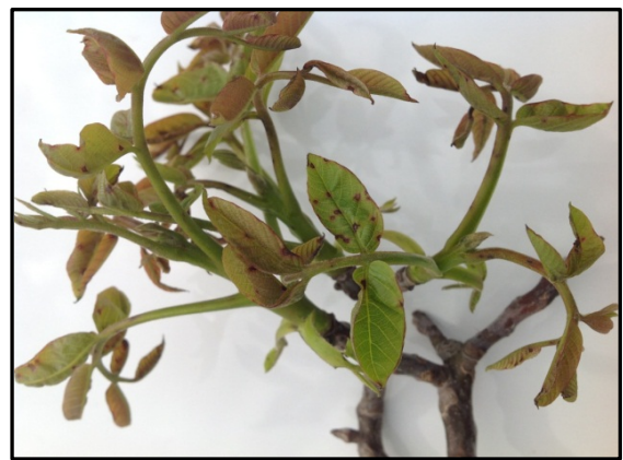
Photo 6. Phomopsis lesions on developing new growth.