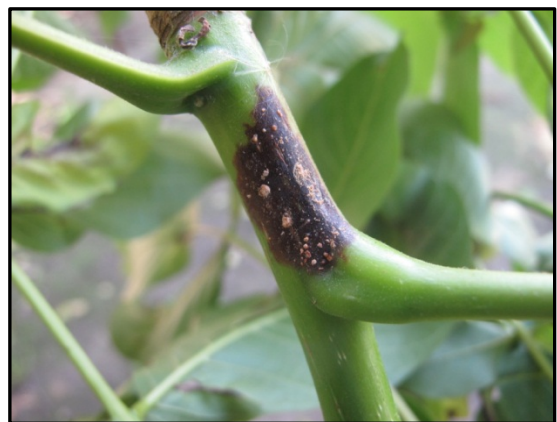
Photo 2. Anthracnose: Shoot lesion showing active sporulation of the pathogen in 'Serr'.