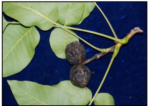
Photo 4. Infection of fruit by Botryosphaeria dothidea moving through the peduncle to the spur (cv. Tulare).