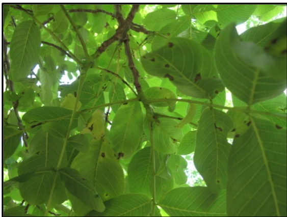
Photo 1. Anthracnose: Advanced leaf lesions on 'Serr'. (These lesions will have mature spores at this stage of development.)

Although the symptomology of initial lesions on leaves may be overlapping and confusing at this time, research may help us develop ways to distinguish symptoms early in the season for each of these diseases by just looking at macroscopic symptoms without using a microscope and/or waiting for results after culturing infected tissues.