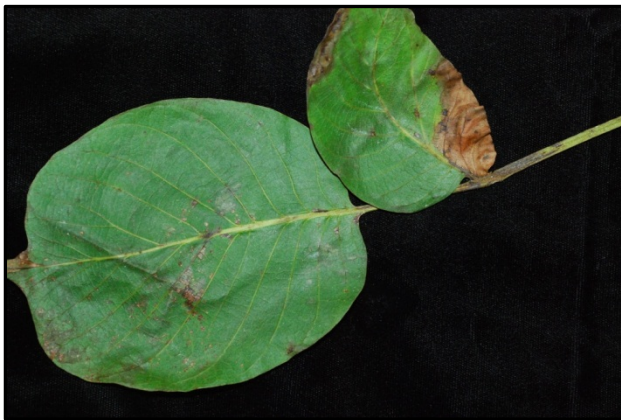
Photo 3. Large necrotic lesions caused by Botryosphaeria dothidea . (Note infection extending into the petiole.)