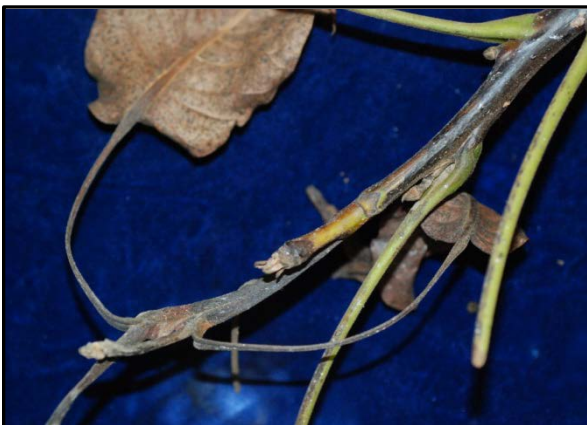
Photo 5. Infection of current growth shoot by Botryosphaeria turn black and result in killing of affected leaves.