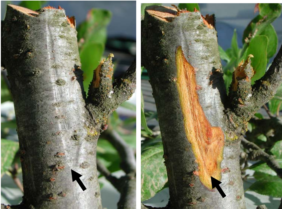
Figure 1. Cytospora cankers are dark and depressed areas on the branch where the bark has been killed. In the first photo, arrow shows edge of canker revealed by knife cut in the second photo.