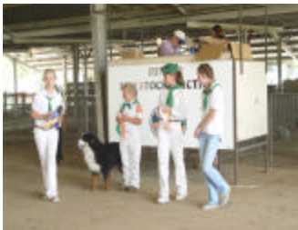
Round Robin Winners, Small Animal, Jr. Div.