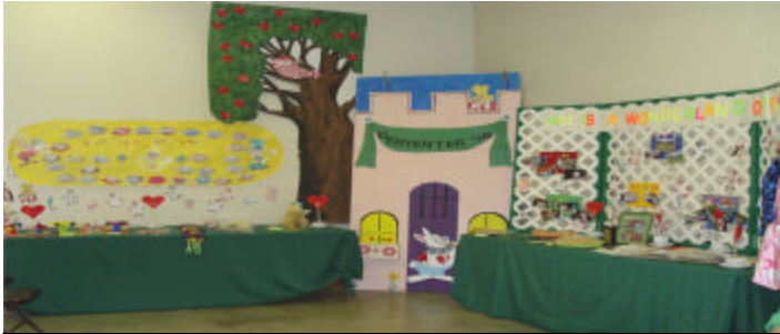
Club Display 1st Place: Dententer 4-H Club, Yuba Co.