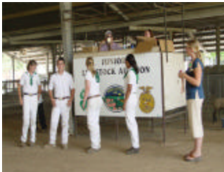
Round Robin Winners, Large Animal, Sr. Div.