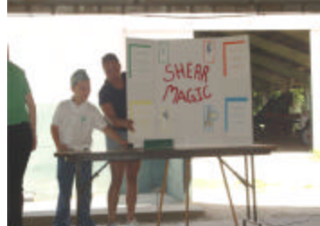
Presentation Day at Spring Fair