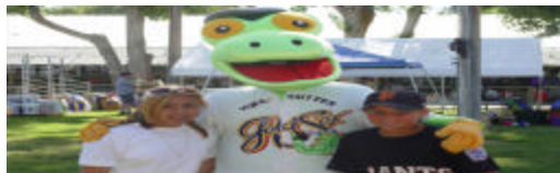
The Gold Sox Gecko With Fairgoers