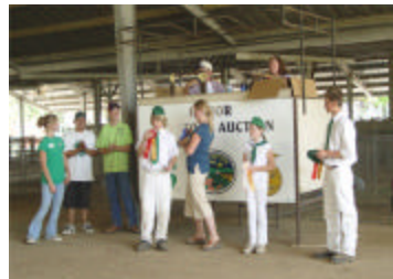
Round Robin Winners, Large Animal, Jr. Div.