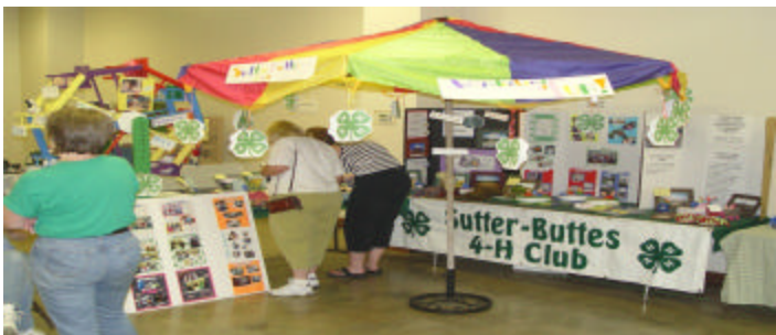
Club Display 1st Place: Sutter Buttes 4-H Club, Sutter Co.