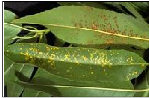
Fig. 2. Almond Leaf Rust