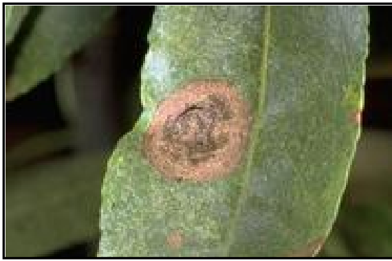
Fig. 1. Alternaria Leaf Spot