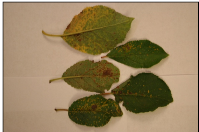
Figure 2 Prune rust lesions on the upper and lower leaf surface. Rusty reddish/brown spores on the lower leaf surface confirm rust.