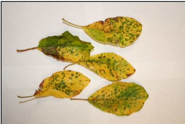
Figure 1 Yellow prune leaves with green spots that do not sporulate are thought to be related to tree stress.

Leaves with multiple rust infections yellow and drop making early defoliation the major problem associated with rust. Reductions in leaf area make it more difficult for the tree to mature the fruit and increase fruit sugar content. Prune rust is notorious for its explosive capacity to become epidemic. The spores can germinate and infect within hours when free moisture is present or the relative humidity is 100%. Rainfall in late spring through summer sets the stage for outbreaks and rust can be exacerbated by morning dews and high humidity. In the Sacramento Valley start monitoring for rust on May first. Monitor trees weekly and treat immediately if any rust lesions are found.