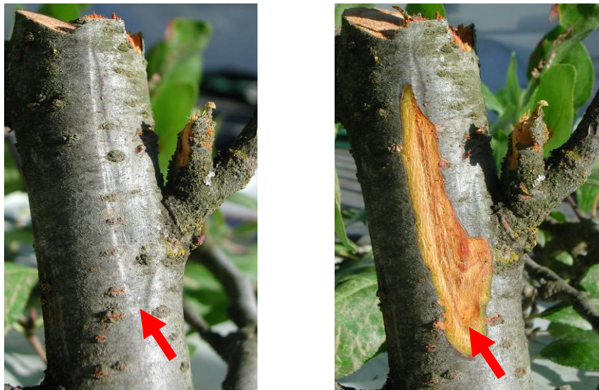
Figure 1. Cytospora cankers are detected as sunken areas on the branch where bark has been killed. Arrows point to canker edges, revealed by a knife cut in the second photo.

For more detailed information on disease management and for excellent photos of disease symptoms and fungus signs that will help you know what to look for, visit the IPM web page ( www.ipm.ucdavis.edu ) and click on Agriculture and floriculture; Prune; and cytospora canker or bacterial canker (under diseases).