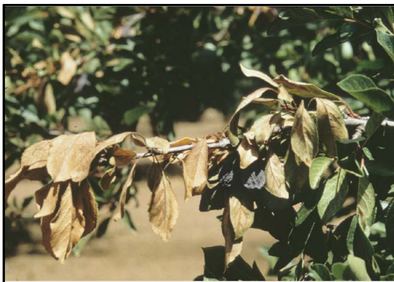
Figure 2. Blue prune and leaf scorch symptoms showing damaged fruit, scorched leaves and darkened leaf veins