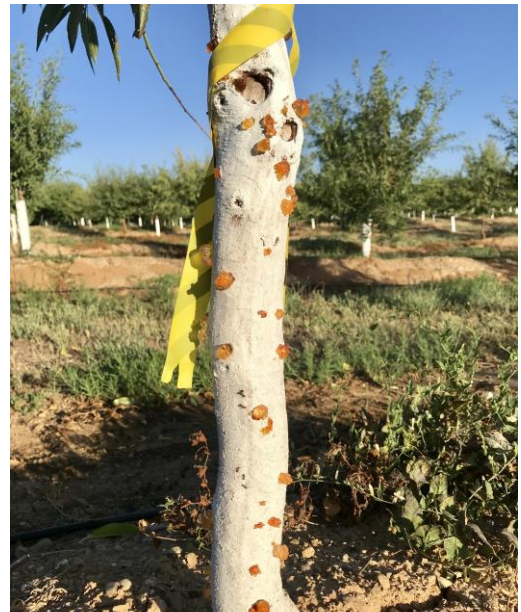
Rely (low rate) on old paint

Dropped Pin: Field Meeting Location . Please enter the field site via Harrington Ave.