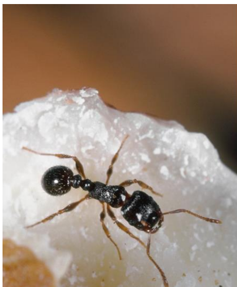
Photos 1& 2. Protein feeding ants. Pavement ants (left) are dark brown, and are covered in coarse hairs. Southern fire ants (right) are characterized by an amber head and thorax and a black abdomen.