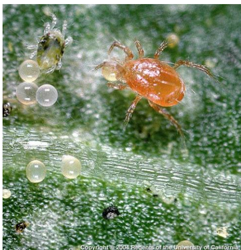
Photo 1. Predatory mite (right) eating the eggs of a spider mite (left) (Photo: UC IPM).

In the Sacramento Valley there are two main predators to look for. The first are species of predatory mites (phytoseiids, Photo 1). These are good mites that eat the bad mites. Phytoseiids have a tear-dropped shape, a shiny appearance, and are often seen running around on leaf surfaces in search of food. They have historically been the main predators found in almond and walnut orchards in the Sacramento Valley.