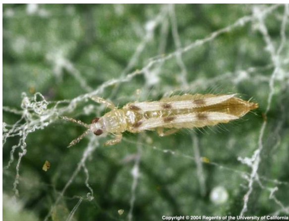
Photo 2. Sixspotted thrip adult, characterized by three dark spots on each of its two fringed wings.

The second predator that has become increasingly important over the past few years is the sixspotted thrip (Photo 2). This predator feeds almost exclusively on mites, can double its population every 4 days, thrives in hot dry conditions, and loves to navigate within spider mite webbing in search of food.