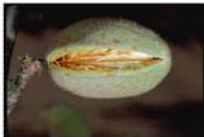
A nut ready for early harvest.

Harvest soft shell varieties ASAP. Nonpareil should be ready for harvest when 95-100% of the nuts at eye level are split (see photo). Test shake a few trees to make sure the orchard is ready to go. If at least 95% of the nuts come off, the orchard is ready to harvest. Be careful with harvest timing. Premature harvest can reduce nut meat quality due to embedded shells. Early harvest is key to a clean crop. Hull split sprays only control 40-60% of NOW larvae, so early harvest is vital to obtain the lowest reject levels – especially in a light crop year.