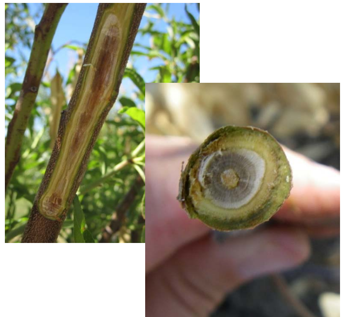
Photo 2&3. Xylem darkening in verticillium affected almond tree.