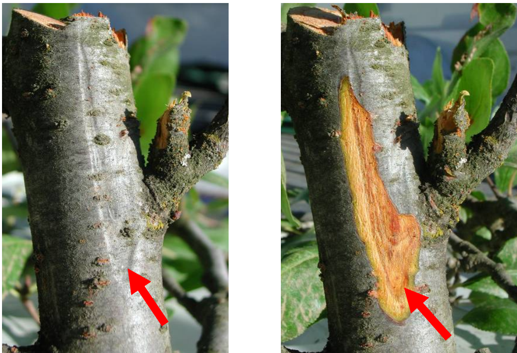
Figure 1. Cytospora cankers are detected as sunken areas on the branch where bark has been killed. Arrows point to canker edges, revealed by a knife cut in the second photo.

For more detailed information on disease management and for excellent photos of disease symptoms and fungus signs that will help you know what to look for, visit the IPM web page ( www.ipm.ucdavis.edu ) and click on Agriculture and floriculture; Prune; and cytospora canker (under diseases).