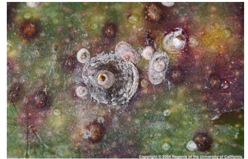
Fig. 1, San Jose Scale

San Jose Scale (SJS) can be found feeding on limbs, fruit wood, spurs, leaves and fruit. Damage is caused by sucking plant juices from the plant and excreting a toxin while feeding. This can weaken the tree and scar the fruit. Female scales are round and have a hard grey covering (fig. 1 center). Male scales are oval (to the right of the female in fig. 1) and when adult males emerge they are yellow and winged. They can be distinguished from the yellow Aphytis scale parasitoid by a black band across the abdomen. First instar crawlers are yellow and are very small.