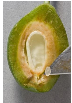
Figure 1. Extracting endosperm at reference date.

Matching the crop load with the tree’s ability to size the fruit and achieve desired size is the goal. Fruit size at reference date, when the endosperm is visible in 80 to 90% of the fruit (Figure 1), can be used to estimate fruit dry fruit size at harvest (Table 1.). Reference date in the Sacramento Valley usually occurs in early May about one week after the pit tip begins to harden but may be later this year because bloom was delayed. At reference date, a random sample of sound (non-yellow) fruit should be collected and the number of fruit per pound determined. Sample 20 fruit from 20 trees. Use orchard history to determine the sizing potential of the block being considered. Unfortunately, with large crops this procedure may overestimate fruit size. Having a good estimate of the number of fruit per tree will help avoid this. Estimate the number of fruit per tree by removing as much of the fruit as possible with a shaker (prune or walnut) from a representative tree or two.